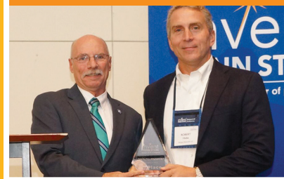
PERSEA Naturals / AvoColor