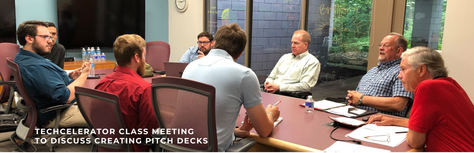
TECHCELERATOR CLASS MEETING TO DISCUSS CREATING PITCH DECKS